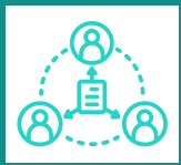
DS2 Data Share Controller

Added Value: Data access rules are automatically enforced on every transaction, ensuring usage policies are respected without manual intervention.