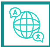
DS2 Culture and Language

Added Value: Only verified organisations will be able to access and share data within CityScape.