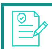
DS2 Policy Creation

Added Value: CityScape members will be able to interact with the dataspace and discover datasets in Romanian.