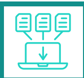
DS2 Data Retrieval

Added Value: The municipality will be able to track data exchanges in an auditable manner.