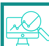
DS2 Data Inspection

Added Value: Researchers will search for data products related to climate and transportation.