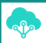
DS2 Sovereignty Decision Support

Added Value: The municipality and other members will evaluate sovereignty risks and generate risk profiles before sharing data, enhancing trust in cross-sector data exchange.